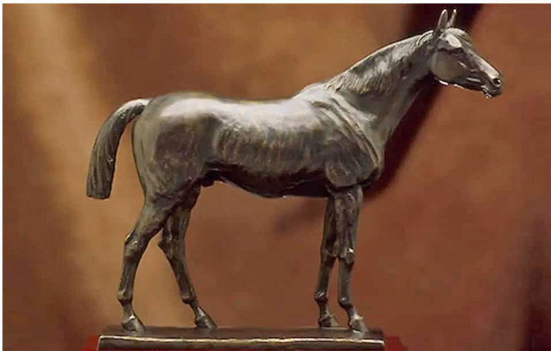
The coveted Sovereign Award Trophy.

Voters across Canada will submit ballots by January 22 for the champions of Canadian racing for 2022. Ceremony on April 13.