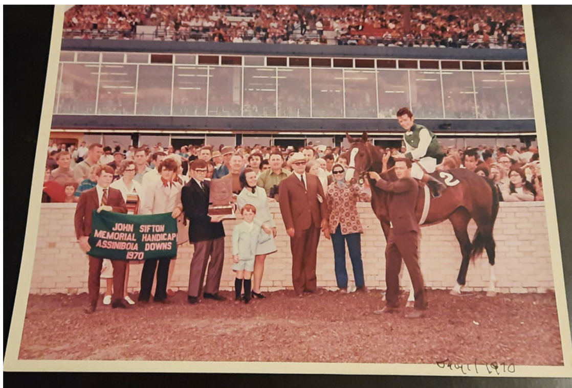
Merry's Hi Note in the winner's circle after her victory in the 1970 J. W. Sifton Memorial Handicap.