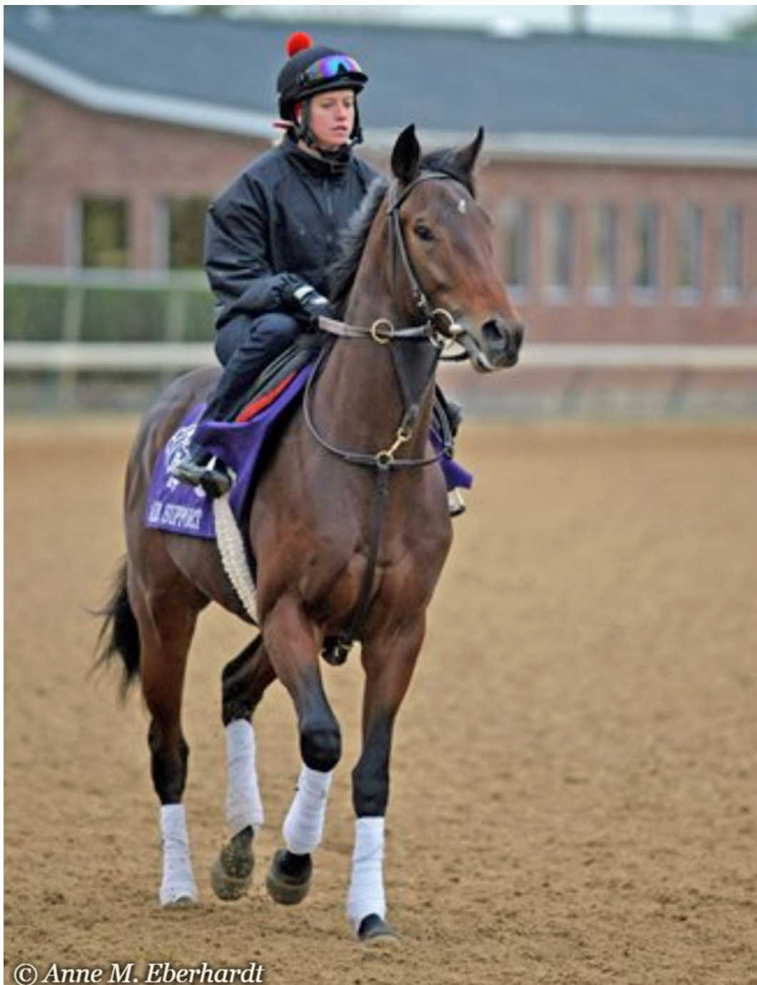
Air Support at Churchill Downs in 2010.