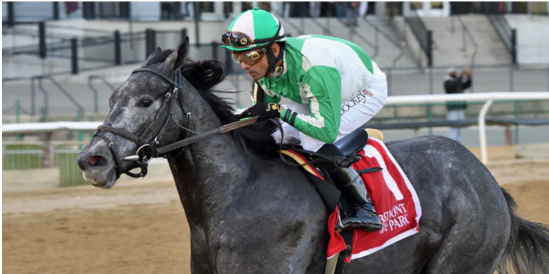
Arctic Arrogance winning at Belmont Park.

Arctic Arrogance will contest graded stakes company for the second time and face six rivals in Saturday's $250,000 Withers (G3) at Aqueduct. The Withers, which was rescheduled from last Saturday when live racing was canceled at the Big A due to high winds and extreme cold, is a prep race on the Road to the Kentucky Derby and awards the top-five finishers 20-8-6-4-2 qualifying points towards the Derby. More from NYRA here .