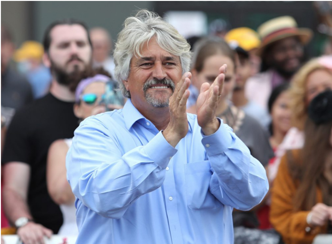
Hall of Fame trainer Steve Asmussen.

Less than two years after setting the record for North American wins, Hall of Fame trainer Steve Asmussen is closing in on another career milestone. Asmussen entered the week with 9,997 North American wins, and he has multiple entries this weekend. Asmussen also has two wins outside North America, including Curlin's victory in the 2008 Dubai World Cup (G1) putting him at 9,999 total career wins. More from the Blood Horse here .