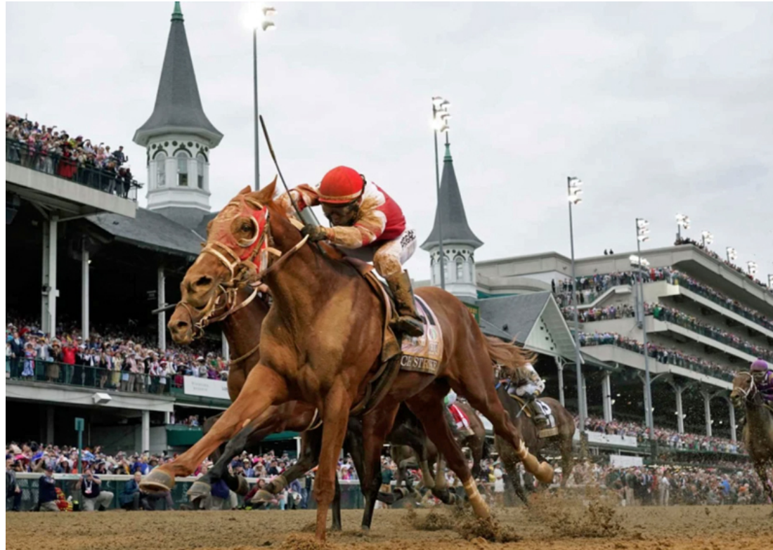
Rich Strike, out of the Manitoba-bred mare Gold Strike, wins 2022 Kentucky Derby.