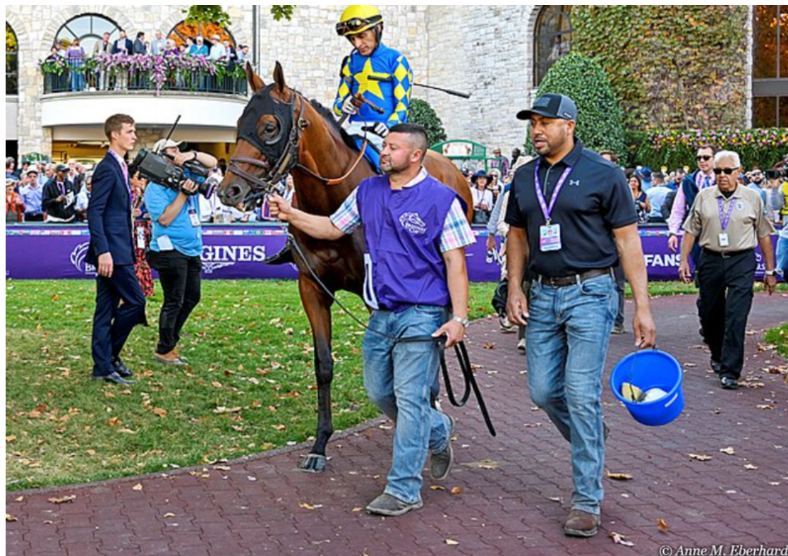
National Treasure in the paddock ahead of last year's Breeders' Cup Juvenile.

The San Felipe Stakes (G2) at Santa Anita Park has proved time and again to be a key steppingstone on the path to the Kentucky Derby (G1). The March 4 edition of the 1 1/16-mile stakes drew a field of 11 that will try to get their share of the 50-20-15-10-5 Kentucky Derby qualifying points available to the top five finishers. More from the Blood Horse here .