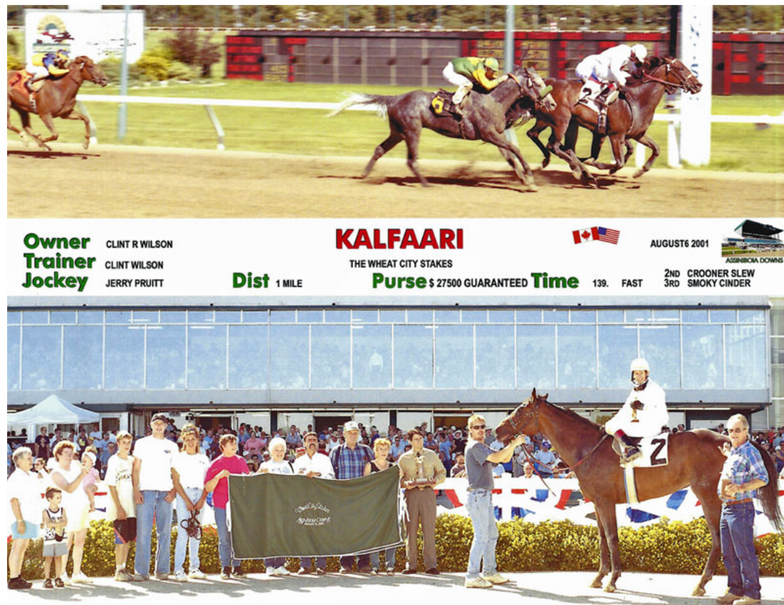
Kalfaari wins the Wheat City Stakes at Assiniboia Downs on August 6, 2001.