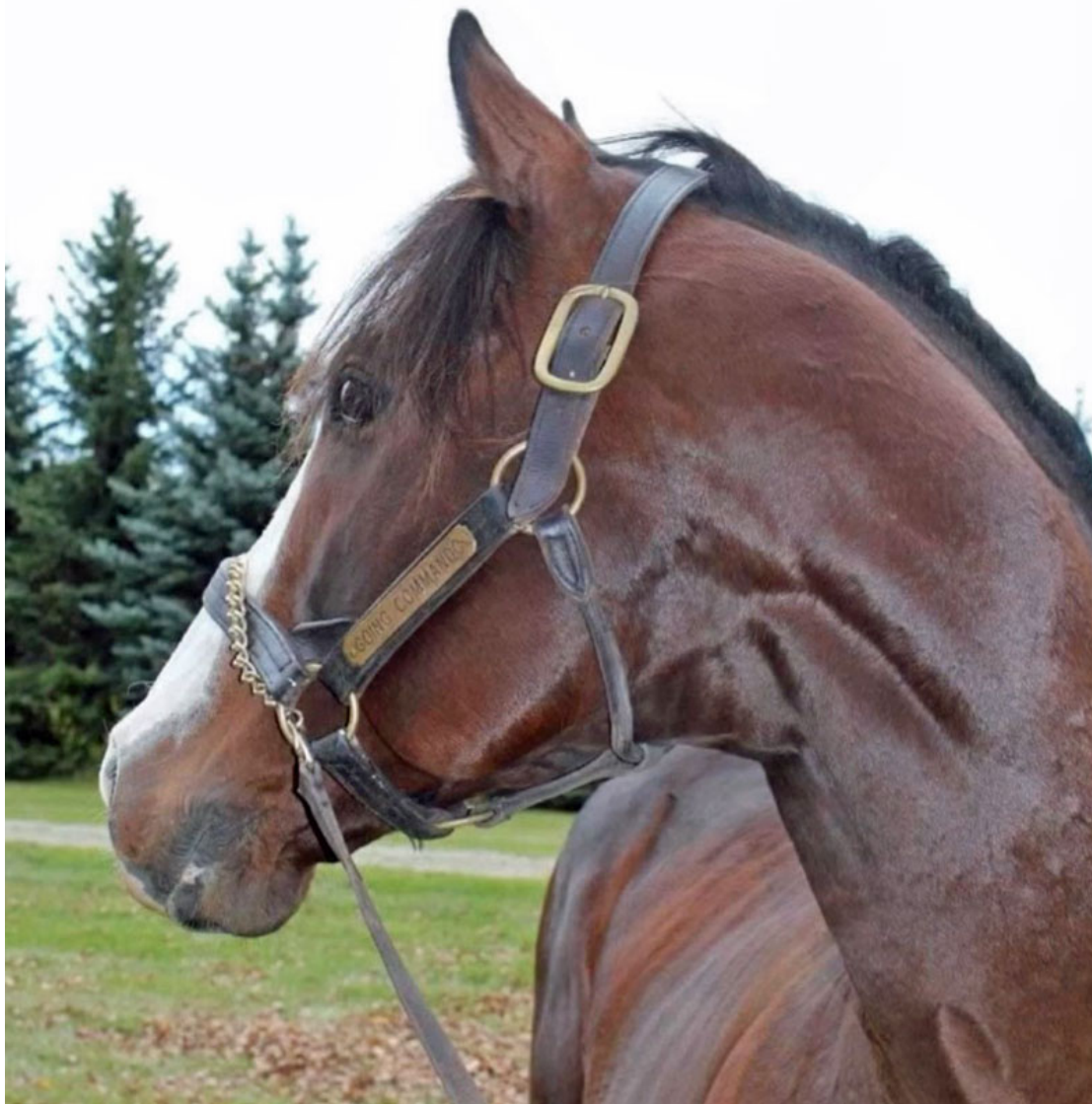
Going Commando looking back.

"He was kind of like the new horse we got, Speculating. We just got a call out of the blue one day, they showed me the pedigree, we made an offer, and they sold him. Speculating is a really nice horse too. Going Commando has left him with some big shoes to fill, but his babies look unreal. We've got four or five on the ground already this year, all with pretty faces and lots of hip on them."