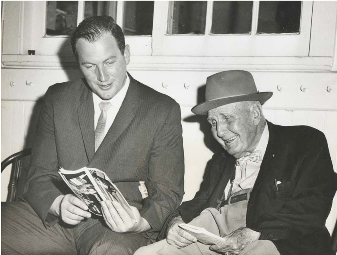
Hall of Famer H. Allen Jerkens, left, with three-time Kentucky Derby winning trainer James "Sunny Jim" Fitzsimmons at Aqueduct, 1962

Trainer Allen Jerkens vanquished more than a few foes that appeared invincible. In 1962-63 he sent out Beau Purple to defeat the redoubtable Kelso three different times. In 1963, Pocosaba took the measure of three-time champion Cicada. And in 1967, the Jerkens-trained Handsome Boy upset Buckpasser in the Brooklyn Handicap. All of the above was a mere warm up for 1973 , when Jerkens conquered the mighty Secretariat not once but twice. Read more about the trainer who is considered to be one of the best horsemen in the history of the sport of horse racing from America's Best Racing here .