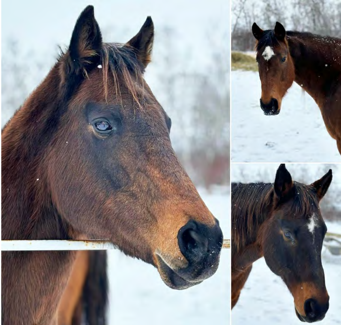
Broodmare Triple Crown. Left: Danger Pay, dam of Champion Escape Clause, Danger Rules. Top right: Jungle Storm, dam of Why So Blue and Jungle Story. Bottom right: High Pioneer, dame of Hidden Grace, Jet Again.

Not only do we have shipping incentives from the Manitoba Jockey Club for runners, we also have a similar program for mares and stallions courtesy of the CTHS Manitoba Division !